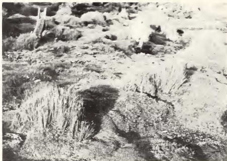
Plate IIa Tussocks on Mount Kenya that have been cropped by hyrax, resulting in a characteristic flat-topped appearance.